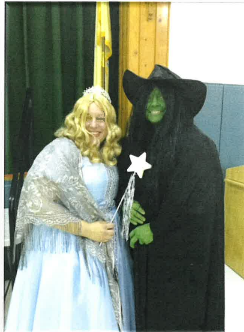
4 th Grade trip to see Wicked on Broadway