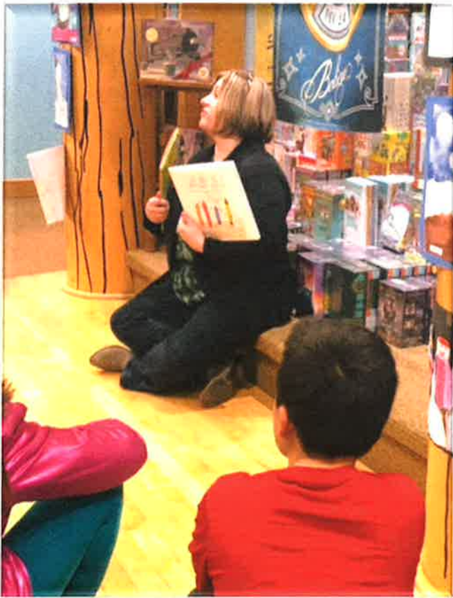
Barnes and Noble Fundraiser